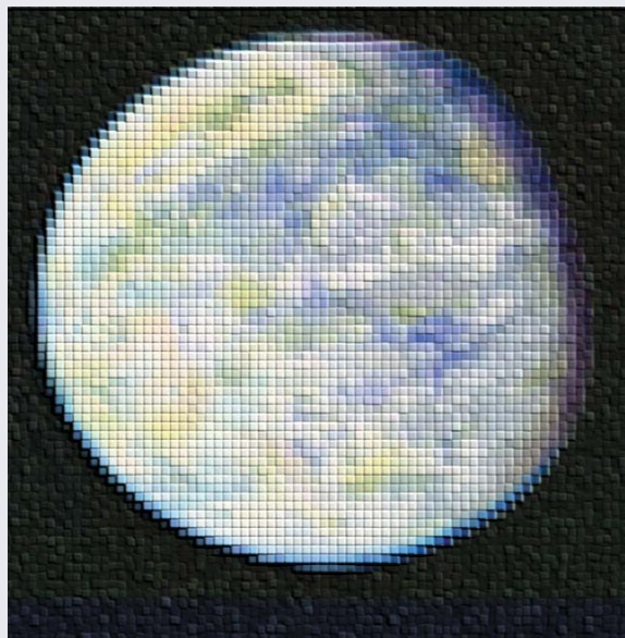
FIGURE 2. GLIESE 832 c is the first exoplanet imaged by the Asteroid Belt Astronomical Telescope. This image, with a resolution of 10 meters, was released last month by ABAT, after the telescope's construction was 1% completed.

Trillions of the self-reproducing sensors can simply be grown in a vat. Once they are deployed in space, a celestial spiderweb of crisscrossed laser beams can push around clouds of those microscopic optical sensors to desired locations. Image readout begins when maser beams