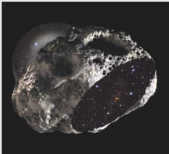
FIGURE 3. FINELY POLISHED ASTEROIDS such as shown here provide the mirror facets of the Asteroid Belt Astronomical Telescope. The flat, reflective surface is about 10 meters across. The polished bump on the asteroid side opposite to the flat mirror allows ABAT's quantum computer to control the facet orientation.

of the legend explain the origin of the feature. "As I remember it," she says,