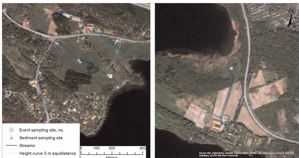
Figure 1 | Satellite imageries of the sampling areas with sampling point, streams and height curves indicated.

The sampling bottles (1 L polypropylene bottles) and the tubes connecting to the sampler were thoroughly washed before use at 80 °C for 10 min. Samples were kept below 4 °C by filling the bottom of the sampler unit with ice prior to each event. The temperature inside and outside the sampler was monitored by loggers (Thermistors, type 10 k NTC, Gemini Data Loggers Ltd, UK). During all