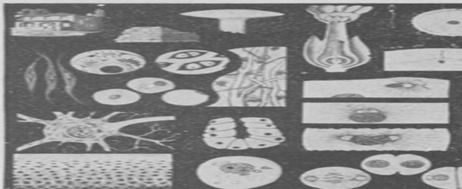
Chart W1 Living Sub

The Third Edition is revised. We feel certain Winslow Charts in accuracy of illustrations and up-to