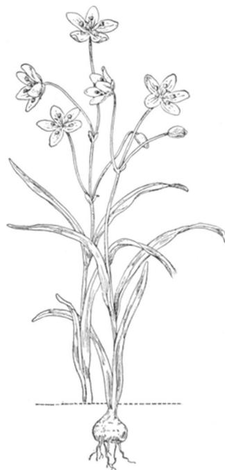
FIG. 164. Spring beauty ( Claytonia virginica )

THE MEIER HERBARIUM AND PLANT DESCRIPTION. A new printing of the Meier Herbarium and Plant Description has come from the press. This book has been used by many thousands of schools. It gives students an opportunity to make studies of special problems, such as: trees in forests, in parks, and along city streets; roadside plantings, plants that prevent erosion, and shrubbery surrounding the home. Studies may also be made of weeds and other harmful plants. The blank page at the right may be used for drawings or for mounting leaves and other distinguishing parts. $1.12. Packages of 25 sheets with directions and index $0.48.