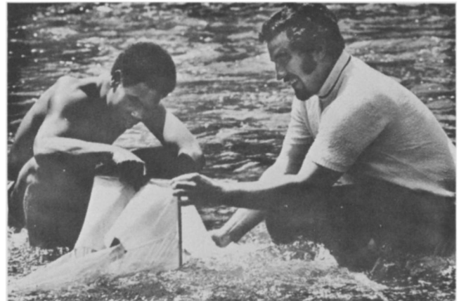
Fig. 1. Student and teacher sample bottom organisms in a stream.

The establishment of an Ecology Club, made up of participants in the program, was planned to provide an opportunity for continuing participation throughout the student's incarceration and after his release.