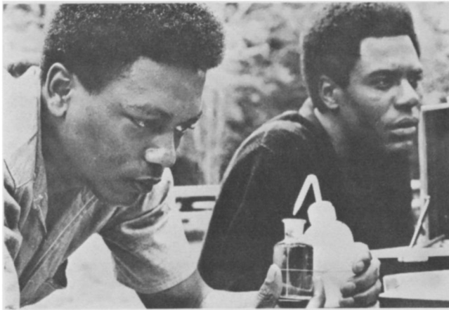
Fig. 2. Ecology students run a chemical analysis of water.