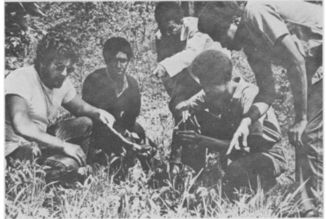
Fig. 3. Looking at plants in Mohican State Park and Forest.