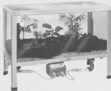
Chamber shown with optional pump for circulating gases.

New 1973 catalog tells it all. Ask for your free copy.