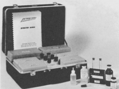
CHEMICAL TEST OUTFITS

High quality, portable Model BD Sampling Pump features long life, simple operations • Inexpensive, disposable battery operation for field trip use • Adjustable, large scale flow meter • Includes lightweight carrying case.