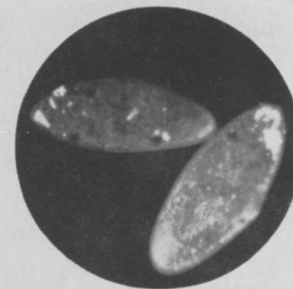
Darkfield unstained paramecium