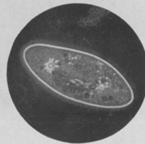
Phase Contrast unstained paramecium

SCIENTIFIC INSTRUMENT DIVISION • BUFFALO, N.Y. 14215