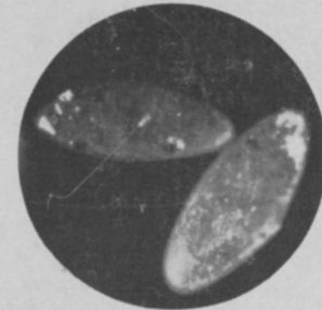
Darkfield unstained paramecium