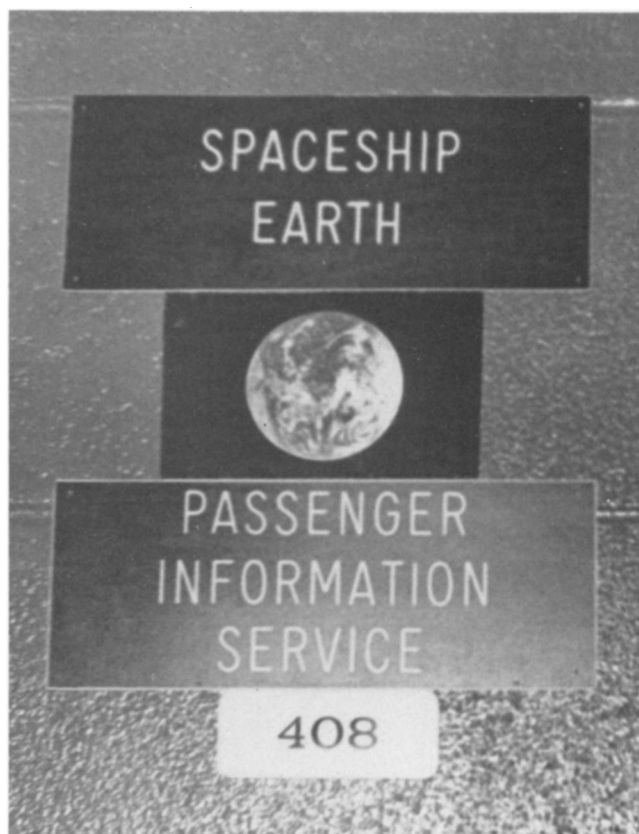
FIGURE 1. Entrance to Learning Center.