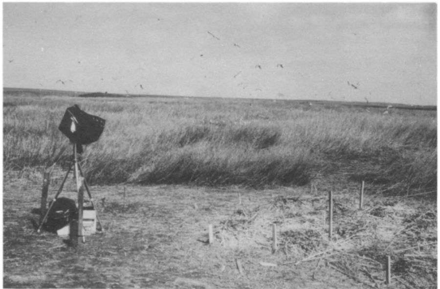
Figure 1. Video camera, recorder and battery set to record behavior in a cormorant colony. The equipment is protected by garbage bags to prevent splattering by gulls.

Early models of video recording equipment were bulky and not well suited for field use. However, recent models produce very high quality visual records and are easily field portable. Internal nickel cadmium batteries (provided with most portable systems), which last a maximum of one and a half hours, are suitable for taping events of short duration. For longer recordings in the field, video equipment may require minor equipment modifications. To allow continuous recordings of up to seven hours,