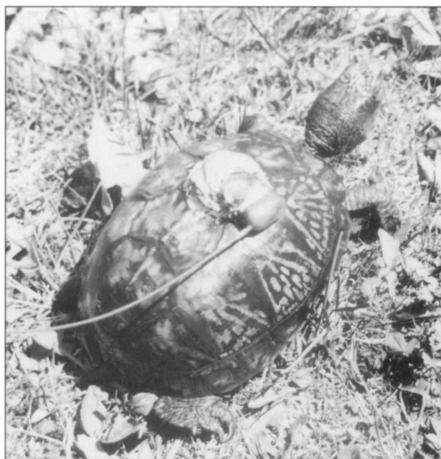
Figure 3. A homing instinct drives box turtles who are moved from their natal woods to wander, for years, in search of their lost home. The box turtle conservation project at McKeever Environmental Education Center provides each homeless arrival with its own radiotransmitter, so that its daily movements can be monitored. Interventions by project volunteers head off danger from highways, cultivated fields and dog attacks for the far ranging turtle.