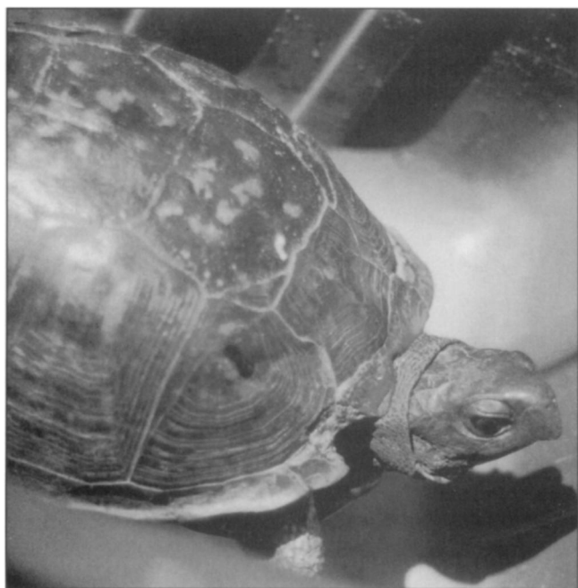
Figure 2. Although young box turtles are very vulnerable, their shells become strong enough by age 7 or 8 to frustrate many predator attacks. This female lost part of her front shell (and two front toes that were under that part of her closed, protective shield) to a gnawing predator. The difficulty of chewing through such a barrier discouraged further gnawing and saved her life. The well-intended removal from her habitat for human care, however, cost her her home when captors forgot her collection site.