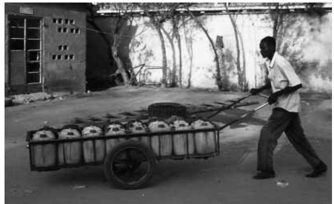
Figure 3 | Water vendor in a street of Kano City, March 1996.

This cholera outbreak caused substantial death, disease, and economic loss. In addition, it created major concern as it occurred at a time when pilgrims were heading to Mecca. However, a rapid epidemiological investigation was possible and yielded useful results that suggested that drinking water sold by water vendors and failure to wash hands with soap before meals were independently associated with illness. In addition, as an ongoing rumour attributed the outbreak to the municipal water supply system, the epidemiological information that ruled out this hypothesis was most useful to local public health officials. Given the complex situation in Kano State, a large-scale intervention to increase access to safe water and improve hand hygiene practices was not undertaken. However, health officials communicated the results of the investigation to the public through a radio address which may have affected people's practices. Although no epidemiological