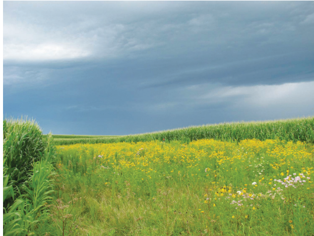
Figure 1 Science-based Trials of Rowcrops Integrated with Prairie Strips (STRIPS) experiment at the Neal Smith National Wildlife Refuge, Iowa.

In the STRIPS experiment, small amounts of reconstructed native prairie vegetation have been integrated into row crop fields to improve the performance and increase the resilience of agricultural watersheds.