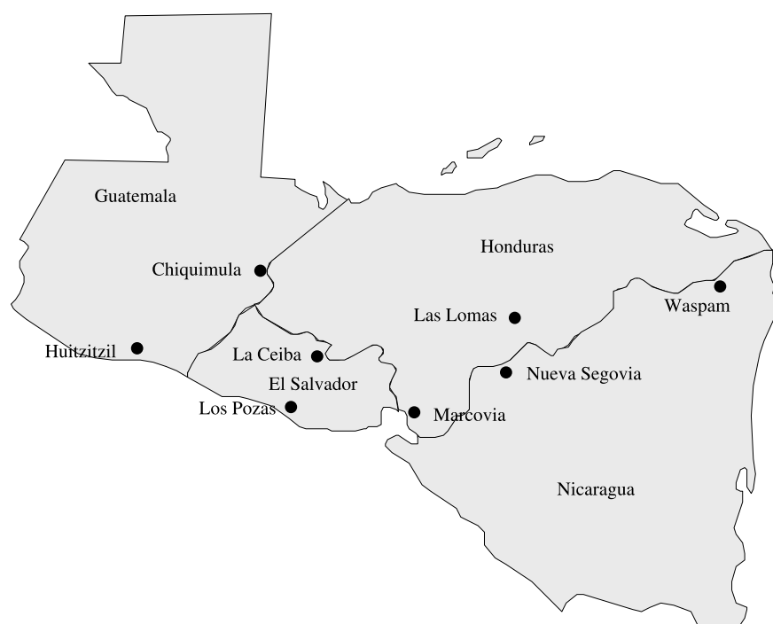
Figure 1 | Study areas chosen for evaluation of water and sanitation interventions.

Two study areas were evaluated in each of the four countries (Figure 1). A study area was a single community or two communities with similar demographics in the same