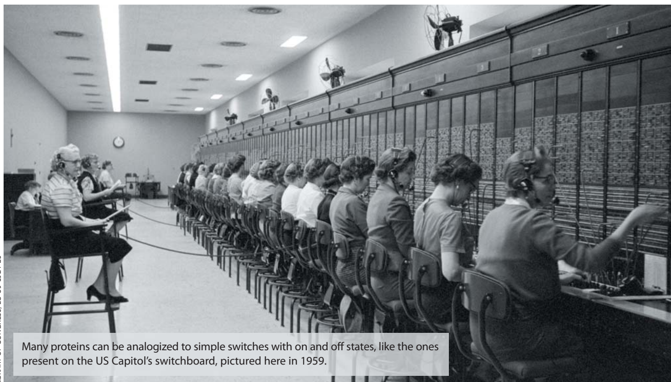
Many proteins can be analogized to simple switches with on and off states, like the ones present on the US Capitol's switchboard, pictured here in 1959.