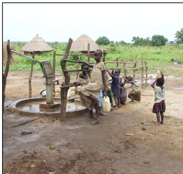
Figure 1 | Hand pump in Okidi where the study was undertaken.

The Okidi settlement is located 20 km west of Kitgum and 30 km north-west of the parent IDP camp Amida. It is a remote settlement with a current population of 4,171. Groundwater is the main water supply and the settlement has three hand pump installations. One lies on the western most edge of the settlement and the other two lie at distances of over 500 m outside the camp. The study was carried out at the first hand pump (Figure 1) as this was the most frequently used allowing easy access to the volunteers. The source consistently tested 0 cfu/100 ml for microbiological contamination, indicating that any contamination in the jerry cans did not come from the water source. Standard 20 litre jerry cans were used with the daily quantity collected per household varying with distance from the water source, family population, source yield and population to source ratio. Water is stored either in the jerry cans or decanted into house-based vessels, the most common being clay pots. Visual observation and microbiological testing of household water storage indicated that the drinking water remains a significant health risk, despite water sources being safe.