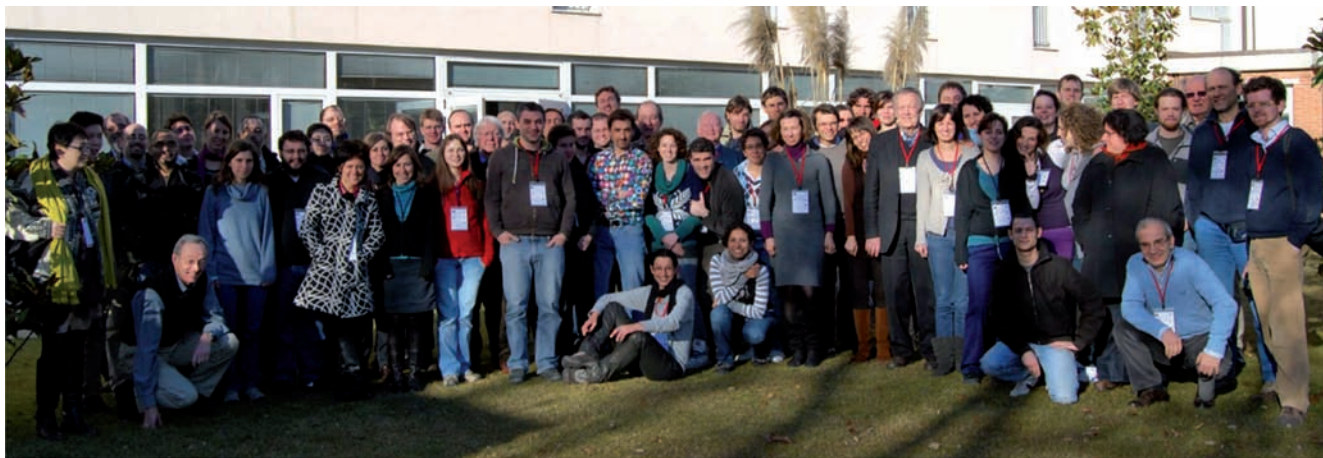
Fig. 2. The participants in the international diamond school.