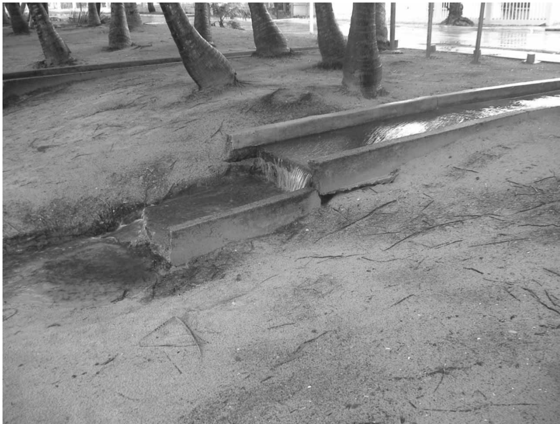
Figure 2 | Outflow from main culvert draining storm water from residential area into transect 5 of the study area.