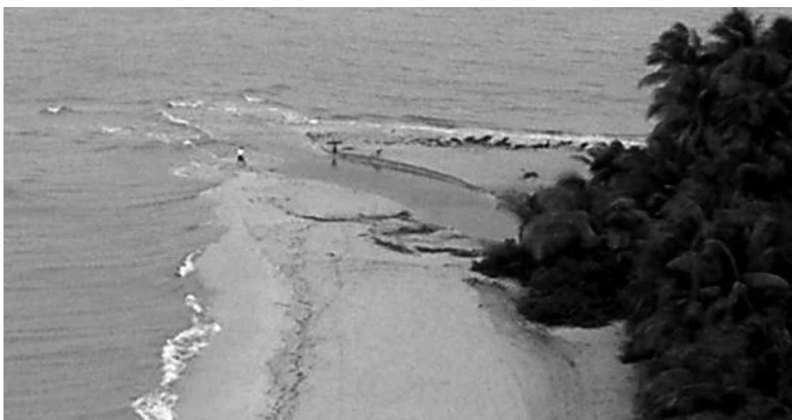
Figure 3 | Mata de Plátano creek draining into Costa Azul beach after breaching sand bar and receiving raw wastewater discharges from pumping station bypass flows.