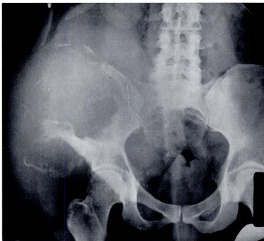
FIG. 1.—Anteroposterior film of pelvis, October 3, 1956.

The volume of packed red cells was 42 ml./100 ml. The white blood count was 7850 per cu.mm. The differential was normal. The morphology of the erythrocytes and platelets was not unusual. The platelet count (Brecher, Schneiderman and Cronkite) was 216,000 per cu.mm. The tourniquet test was negative. Clotting time (Lee-White) was 15 minutes (control, 12 minutes). Qualitative clot retraction was good after two hours. The thromboplastin generation test (Biggs and Douglas) was abnormal. The defect was localized to the patient's serum since the test became normal after the addition of normal serum. Additional studies showed that this patient's serum did not correct the coagulation defect of a patient with known PTC deficiency. The alkaline phosphatase was 5.5 Bodansky units; the serum calcium 10.8 mg. per hundred ml. and the serum phosphorus 3.5 mg. per hundred ml.