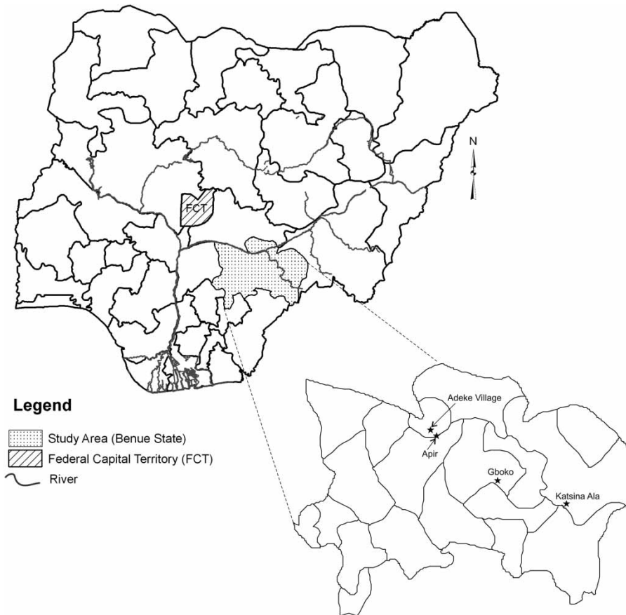
Figure 1 | Study area map.

based on the circumstances surrounding each death (Gundu 1998). Although colonial administrators established a cemetery in each urban settlement in Tivland, such sites were rarely used by the tribe. By Tiv tradition, a deceased family member must be buried in his/her ancestral village irrespective of the place of death. Only a child (usually less than 10 years old) may be buried elsewhere, depending on the distance the family resides away from their village. The Tivs adhere strictly to this practice to the extent that even corpses of deceased members residing in foreign countries must be returned home for burial. The cultural and spiritual underpinnings of Tiv burial traditions are however beyond the scope of this article. An interested reader is directed to Gundu (1998) for a full account. Of closer significance to this study are the factors that determine the selection of grave sites in Tiv villages.