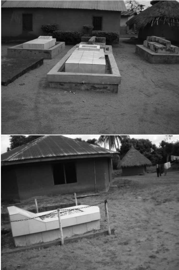
Figure 2 | Typical village compounds with graves beside them.

those possessing a relatively high status, may be buried in the centre of the compound.