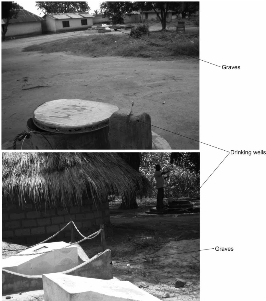
Figure 3 | Example well location relative to graves.

in the contamination. At this pilot stage however, no further analyses were performed to isolate the bacteria types, hence, the contamination cannot be attributed directly to gravesite leachate. Isolation of bacteria type is critical for attribution because other sources of bacterial contamination are possible. For example, because >90% of the wells are hand-dug, they have large diameter openings (>0.5 m), many often with inadequate coverings such that rodents and other reptiles may fall and decompose in them, leading to bacterial contamination. Moreover, water is drawn manually with ropes tied onto buckets in ways that are not very hygienic (see Figure 4). Nonetheless, the evidence of bacterial contamination, irrespective of