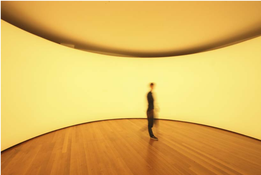
Figure 2. Olafur Eliasson, 360° Room for All Colours , 2002. Stainless steel, wood, fluorescent lights, color filter foil (red, green, blue), projection foil, control unit 320cm, ø 815cm. Museum of Modern Art, New York, 2008.

multiple dimensions of curvature (“contours”)—that is, the bubble itself or the bending arc of a rainbow. Color is entire and enveloping. Following Benjamin, the child’s images of the bubble and the rainbow—both important structures for Eliasson—provide dual metaphors for an immersive observation of color, producing an “interrelated totality of the world of the imagination” that is “full of light and shade, full of movement, arbitrary and always beautiful.” 27