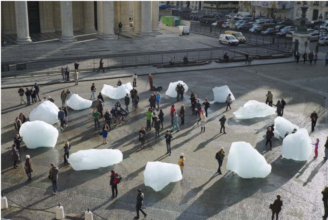
Figure 1. Olafur Eliasson, Ice Watch , 2014. Twelve ice blocks. Place du Panthéon, Paris, 2015. Photo by Martin Argyroglo, © Olafur Eliasson