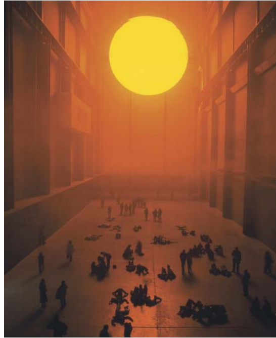
Figure 4. Olafur Eliasson, The Weather Project , 2003. Monofrequency lights, projection foil, haze machines, mirror foil, aluminum, scaffolding 26.7×22.3×155.44m. Tate Modern, London, 2003.

His goal, repeated frequently by both the artist and critics, is to guide the viewer toward recognizing and realizing mediation and mediated environments, drawing particular attention to the spaces of the museum as themselves places of constructed and controlled encounters between subject and object. 33 As he notes, “The benefit in disclosing the means with which I am working is that it enables the viewer to understand the experience itself as a construction and so, to a higher extent, allow them to question and evaluate the impact this experience has on them.” 34 Turning the viewers’ attention to the materials of The Weather Project , Eliasson aimed to draw the spectators into a recursive phenomenological field that implicates them in their own acts of looking. As noted in the reviews of the installation, many of the more than 2 million people who came to the exhibition during its six-month run lay down on the floor of the museum, turning their eyes upward to gaze at their own reflected image. They became part of the spectacle, enclosed by and continuous with the yellowed space of the Turbine Hall. Eliasson’s immersive weather experiment turned spectators and their experience into the work of art itself, implicating the viewer in the phenomenological process of “seeing yourself seeing,” as he puts it. 35 His emphasis on defamiliarization and demystification—on revealing for the spectator something that was previously unseen,