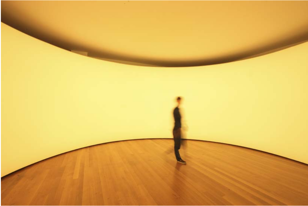
Figure 2. Olafur Eliasson, 360° Room for All Colours , 2002. Stainless steel, wood, fluorescent lights, color filter foil (red, green, blue), projection foil, control unit 320cm, ø 815cm. Museum of Modern Art, New York, 2008. Photo by Studio Olafur Eliasson. Courtesy of Jarla Partilager, private collection. © Olafur Eliasson

multiple dimensions of curvature (“contours”)—that is, the bubble itself or the bending arc of a rainbow. Color is entire and enveloping. Following Benjamin, the child’s images of the bubble and the rainbow—both important structures for Eliasson—provide dual metaphors for an immersive observation of color, producing an “interrelated totality of the world of the imagination” that is “full of light and shade, full of movement, arbitrary and always beautiful.” 27