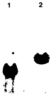
Fig 2. Detection of EBV DNA in lymphoma tissue by Southern hybridization. DNA (20 \mu g) extracted from lymphoma tissue obtained at autopsy was cleaved with Bam HI, subjected to electrophoresis (1.5 V/cm, 18 hours) through a 0.75% agarose gel and transferred to a nitrocellulose sheet. This gel replica was hybridized to PKD-52, a Bam W fragment of EBV in pBR322 (a gift from E. Kieff, University of Chicago, Chicago). Lane 1, 20 \mu g lymphoma DNA, lane 2, 30 pg pBR322 was added to 20 \mu g lymphocyte DNA from an EBV-seronegative control, equivalent to ten copies of viral DNA per cell. The hybridization in lane 2 is with pBR322 and not with EBV, as shown by different location of the hybridization band compared with lane 1.

polyclonal activation of B cells, followed by emergence of a monoclonal neoplasm. HTLV-III is the primary etiologic agent in AIDS. 1-3 The T4 antigen, or a closely related membrane antigen, appears to be necessary for entry and permissive infection of HTLV-III in T lymphocytes. 22,23 Because some activated B cells express the T4 antigen and, in vitro, HTLV-III can infect T4-bearing lymphoblastoid cell lines transformed by EBV, it is possible that HTLV-III could directly infect in vivo activated B cells and play a primary pathogenetic role in the development of B cell neoplasia in AIDS. 23 Our study of this case argues against such a model. There were no sequences related to HTLV-III in the B cell lymphoma, despite clear serologic evidence of HTLV-III infection in the host. A more likely model, based on our study, would be the emergence of an EBV-transformed B cell clone resulting from impaired cellular "immunologic surveillance" due to infection of T cells by HTLV-III.