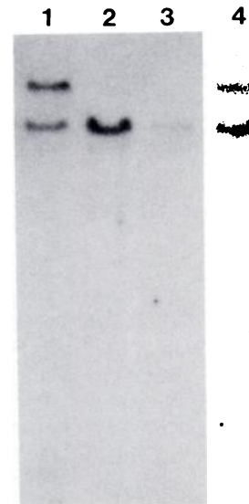
Fig 3. Detection of rearranged c-myc gene by Southern hybridization. Lymphoma tissue DNA (20 \mu g) was cleaved with Eco RI, the DNA fragments were separated by electrophoresis (1.7 V/cm, 18 hours) through a 0.75% agarose gel. The DNA was then transferred to cellulose nitrate under partial vacuum, fixed, and hybridized with 32 P-labeled 3rd exon of human c-myc (Hu 3' myc , 1.2 kb, RI- Cla , 3rd exon) in pBR327 (Taub) (a gift from P. Leder, Harvard Medical School, Boston). Lane 1, Raji (Burkitt's lymphoma with detectable rearrangement of c-myc ) cell DNA; lane 2, P3HR1 (Burkitt's lymphoma without detectable rearrangement of c-myc ) cell DNA; lane 3, lymph node DNA from a fatal EBV infection in a patient with X-linked lymphoproliferative syndrome with a polyclonal, karyotypically normal EBV-induced B cell proliferation; lane 4, lymphoma tissue DNA from the AIDS patient.

Serologic studies in AIDS demonstrate high titers of antibodies to EBV antigens, suggesting reactivation of this virus in some patients. 5 Previous case reports have indicated