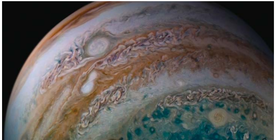
FIGURE 1. THIS VIEW OF JUPITER'S SWIRLING ATMOSPHERE features two storms caught in the act of merging. The two white ovals, left of center in the orange-colored band, are anticyclonic storms that rotate counterclockwise.

Jupiter is oblate, a feature that shows up as a gravitational quadrupole and causes a precession in Juno's elliptical orbit. The winds also express themselves in Juno's trajectory. The spacecraft's tracking ability, enabled by a microwave link to NASA's Deep Space Network, is so exquisitely good—better than a factor of 1 part in 10 million in the gravity potential—that scientists can determine higher-order harmonics of the gravity field and discern differences between northern and southern hemispheres caused by the differences in the winds