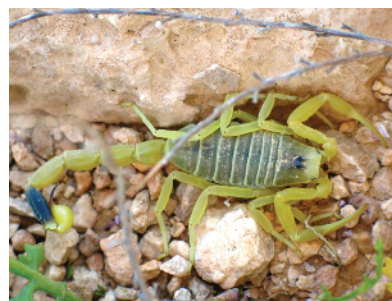
A peptide component of the deathstalker scorpion's venom may help pinpoint glioblastoma cells.