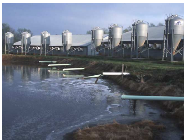
Figure 3 | Swine waste lagoon (Georgia, USA).

The shift towards animal confinement has affected the methods and options for handling the waste prior to disposal. With insufficient space available for each animal to freely excrete and for natural systems to absorb and decompose these wastes, confined swine and cattle operations have developed water-based slurry systems that essentially flush waste from the floors where the animals are housed, and channel the liquid slurry into large ponds for storage (Figure 3). With the exception of poultry operations, industrial food-animal operations use water or slurry-based systems, requiring large pits for storing the increased volumes of waste (United States Environmental