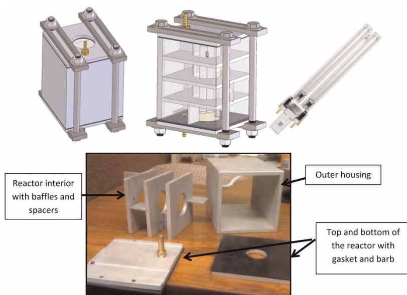
Figure 1 | Three-dimensional model, photo of the UV bulb (Phillips PL-S9W/TUV), and photo of the disassembled UV POU reactor.

Figure 1 is a three-dimensional model of the POU UV reactor design, a photo of the UV bulb, and a photo of the reactor. This final design follows four iterations (not shown) of design, construction, testing, and redesign. The outer housing is a 1/4 inch-thick aluminum square tube. The interior of the reactor consists of three 1/4 inch-thick square aluminum baffles with 1/8 inch-thick aluminum spacers. A 2 inch diameter UV transmitting quartz tube runs through the middle of the reactor, and the entire system is sealed with gaskets and clamped shut. Water exits and enters the reactor through two fittings (1/8 inch hose barbs 1/4 inch-thick male pipe thread). The total volume of the reactor was 770 mL. The UV bulb installed was a 9 watt, 60 volt, 0.17 amp low-pressure mercury lamp developed by Philips (PL-S9W/TUV). The system was designed so the bulb slides into and out of the quartz tube without dismantling the reactor so bulbs can be replaced easily.