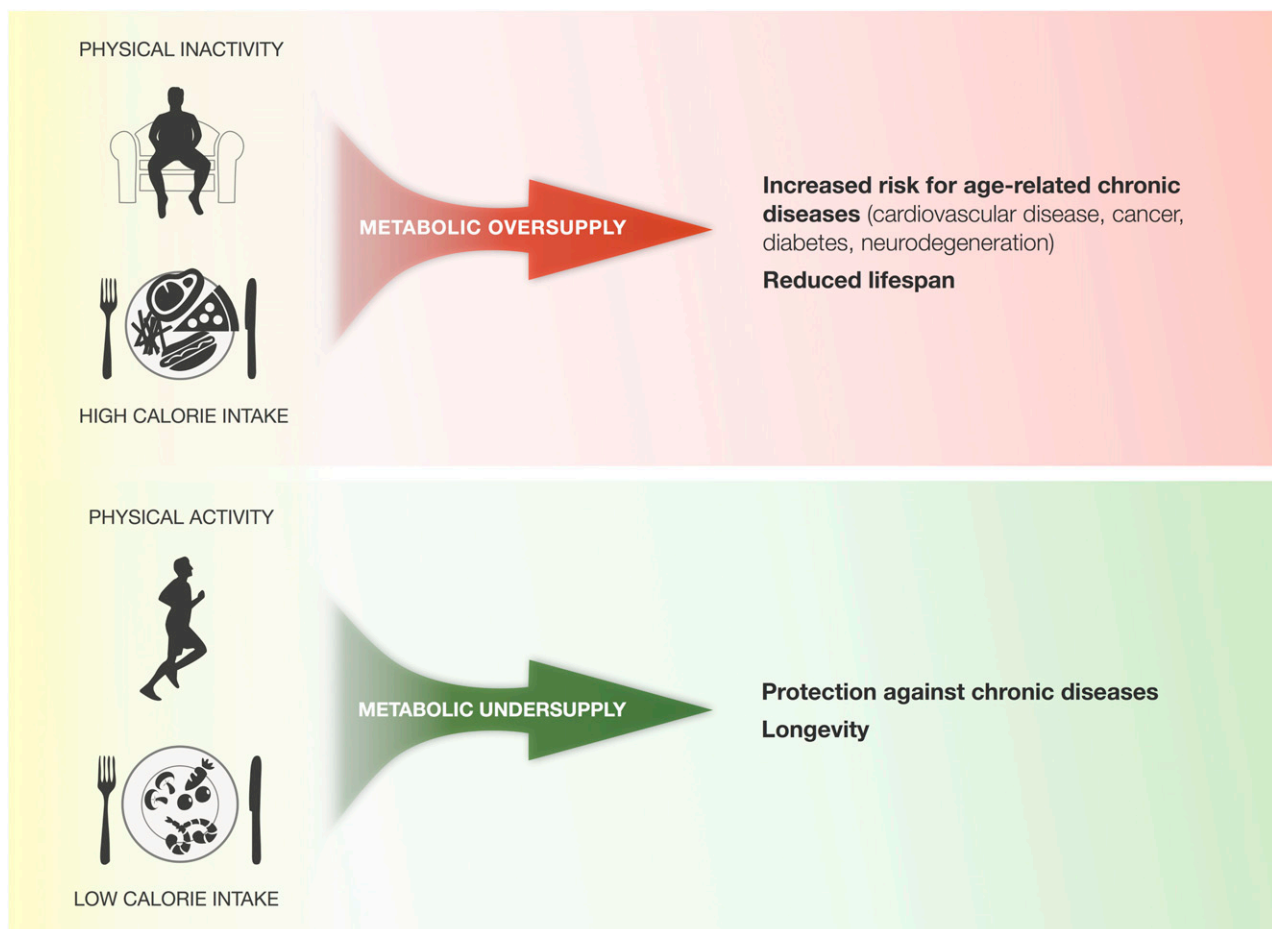
FIG. 1. Effect of physical activity/inactivity and calorie intake on health outcomes. Chronic physical inactivity and overeating create a state of metabolic oversupply that predispose to age-related chronic diseases and reduce life span. In contrast, physical activity/exercise and limited calorie intake create a state of metabolic undersupply that improve health and resilience of most organ systems, and can hereby promote longevity.

A primary consequence of metabolic oversupply is oxidative damage to molecules including mtDNA. As a result, ongoing accumulation of mutated mtDNA in tissues (brain, skeletal muscle, intestine), which is a hallmark of aging, occurs at increased levels in patients with diabetic hyperglycemia (25–27). Experimentally induced diabetes (28) or the natural predisposition to hyperglycemia and hyperlipidemia in animal models (29) results in increased accumulation of mtDNA mutations, demonstrating that chronic metabolic oversupply is damaging to mtDNA. In turn, mtDNA defects may accelerate telomere shortening. Telomeres are repetitive DNA sequences and associated proteins located at the end of chromosomes that generally get shorter with time (30) and are another hallmark of cellular aging and senescence (31). Interestingly, telomeres erode prematurely in the tissues of obese individuals (32) and those with diabetes (33), and telomere shortening is inversely correlated with the number of diabetes