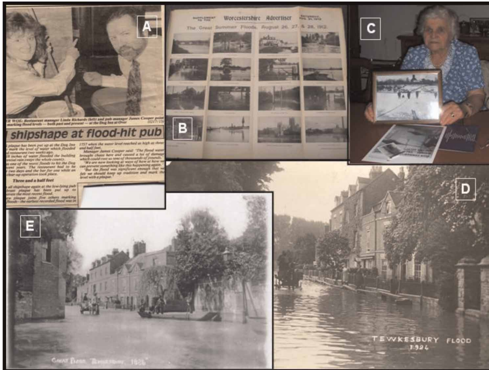
Figure 2 | Other examples of flood materialisation A. 1990 Severn flood being marked as part of a series going back to 1757 (flood marks since removed with property redevelopment ( Gloucestershire Echo); B: 'The Great Summer Floods' August 1912 ( Worcestershire Advertiser); C: Oral history and digital stories – remembering 1947 floods at Elmore, Lower Severn; D and E: Postcards recording previous summer floods on lower Severn (both Church St, Tewkesbury) – June 1924 floods and May 1886 floods.

down anywhere. But it wasn't. It is now. (Head of Community Leadership, County Council)