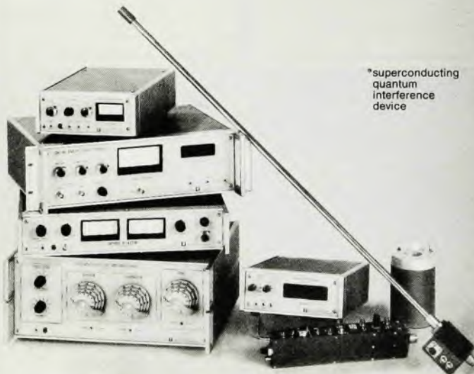
*superconducting quantum interference device