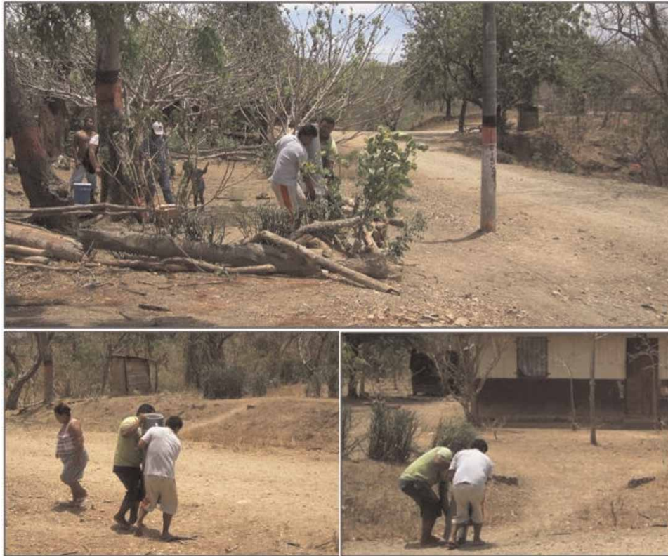
Figure 1 | Installed BSF (full size with PVC casing) being transported across the street from one household to another in Nicaragua (photo credits: J. Napotnik).

This study investigated the effects of moving and agitation on filter performance. Following a nine-month contaminant removal study on 12 full-scale BSFs (four each of three different types: traditional concrete, 5-gal plastic bucket, and 2-gal plastic bucket; 5-gal bucket = 18.9-L bucket, 2-gal bucket = 7.6-L bucket), the filters were moved approximately 1 km to a new laboratory location. Although the moving distance was short, the size and weight of the filters required the use of handcarts and a moving truck. All efforts were made to minimize tilting and disruption of the filters, but some jostling could not be avoided. For 8 weeks following the move, the filters were monitored for hydraulic loading rates (HLRs) and Escherichia coli removal.