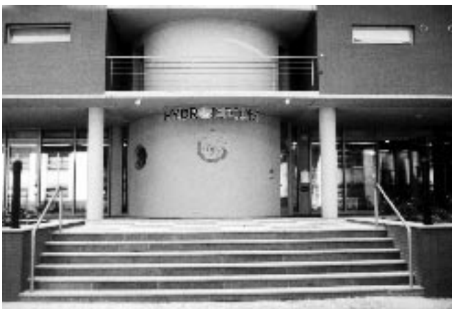
Figure 3 | Hydroinform a.s.: entrance to the building in Prague.