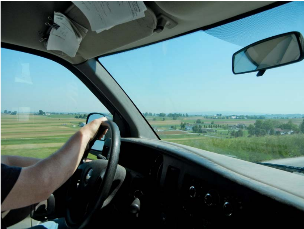
Figure 1. A view of Pennsylvania farmland from the inside of a feed company work van.

I also attended workshops hosted by the feed company as well as Family Days on the Farm, an Amish-organized fair that hosts lectures and workshops focused on organic farming. The Amish-hosted fairs both paralleled and diverged from the language of the company-sponsored workshops. Religion and science were rhetorically entangled in both educational events, and Amish understandings of human intervention into nonhuman worlds were predicated on a balance between the two systems of thought.