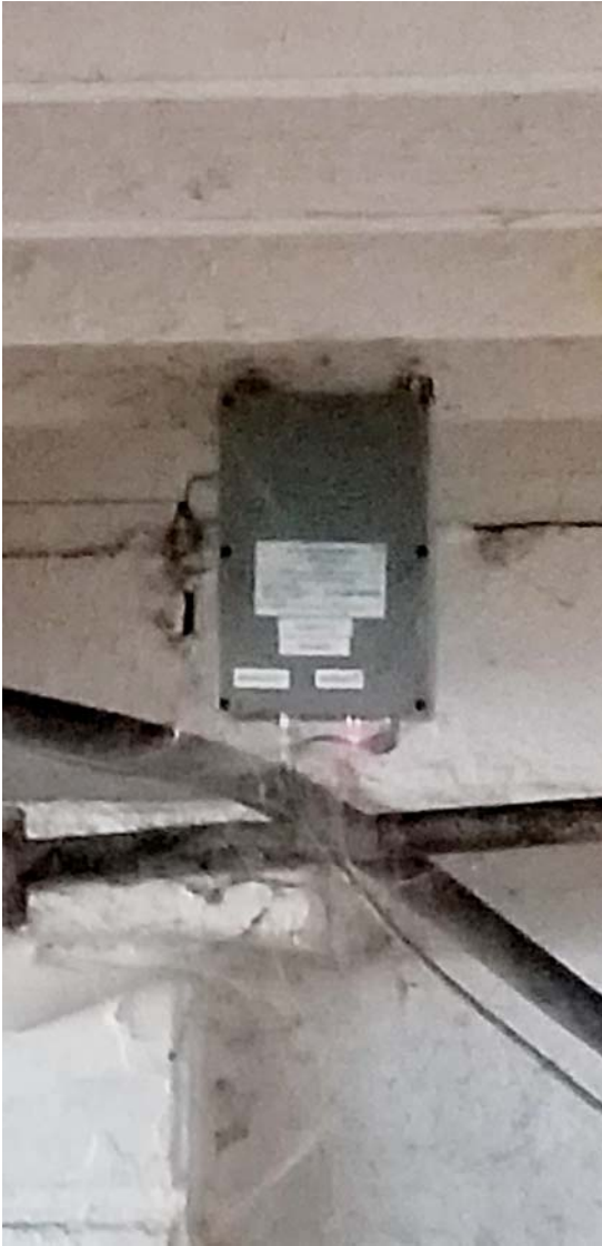
Figure 2. A Talya Water System installed in an Amish barn.

had built with its customers. 25 Outside advice could complicate the interactions between farmers and their cattle in ways that affected the feed company's business. For the company to successfully provide the most useful milk production guidance, it needed to understand what the farmer was feeding, how he was milking, and the entire package of decisions he was making regarding his cattle in the barn.