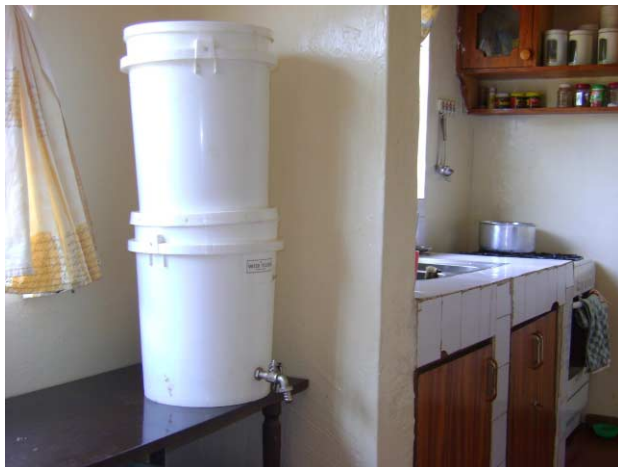
Figure 3 | Hom device for rendering water potable in use in a household.

To assess the public acceptance potential of the Hom device for rendering water potable, preliminary surveys were conducted in three convenient public exhibitions. In each exhibition venue two complete device units were displayed on a stand. The first venue considered was a three-day annual exhibition organized by the Commission for Higher Education (CHE) for Kenyan Universities held on 15–18 March 2006 in Nairobi. At a frequency of every 10–15 min, a visitor to the stand, regardless of gender, was invited to fill in a one page response sheet after being fully informed about the nature and functioning of the device