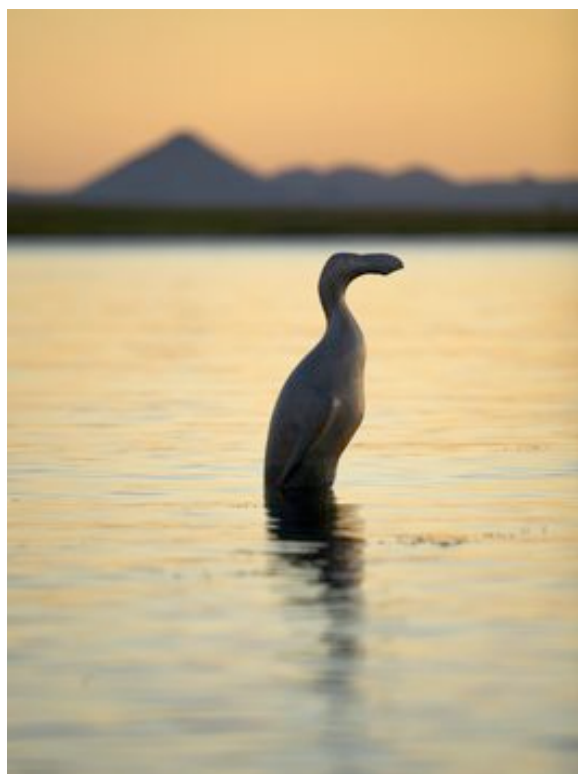
Figure 1 Geirfugl / Great Auk , sculpture in aluminium by Ólöf Nordal 1998. (Photo: © Vigfús Birgisson, published with kind permission of Ólöf Nordal).