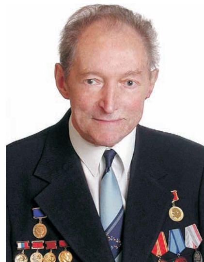
Vladimir Konstantinovich Chernyshev

Vlad's crowning achievements were magnetic flux compression generators that have reached performance levels unmatched by any other pulsed-power system in the world. In 1961 he invented the disk electromagnetic generator, a device that has generated up to 300 MA and 200 MJ in a 12-microsecond pulse. In 1998, he was awarded the Russian Government Prize for the development and scientific applications of the DEMG. Vlad's team developed the Potok series of helical generators and various types of opening switches that shorten a generator's output; with them the team achieved 90-MA pulses in 1 microsecond. At the time of his death, Vlad strongly believed that modern DEMG technology and MAGO ( magnitnoye obzhatiye , or magnetic compression) plasma-formation systems, which he developed in partnership with one of us (Mokhov), had now made it possible to achieve the scientific breakeven point for fusion without the large initial capital investment that is required by the two more conventional approaches, magnetic confinement fusion and inertial confinement fusion.