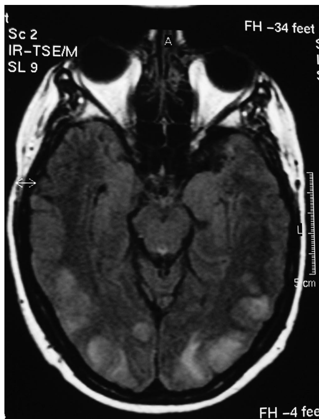
Fig. 1. Axial T 2 -weighted magnetic resonance (MR) image of the brain with fluid-attenuated inversion recovery sequences performed at the onset of cortical blindness on postoperative day 26. The MR image shows bilateral hypersignal in the occipital, temporal, and parietal regions, suggesting focal cerebral edema.

patient's very slow clinical improvement during the first 3 weeks was less expected, since recovery is usually complete within 1 week. However, persistent elevated blood pressure related to preeclampsia has been described 6 weeks postpartum. 6