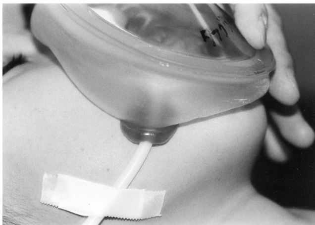
Fig. 1. The gas leak between the nasogastric tube and the cushion of the mask was covered with a denture adhesive while the tube came out of the right side of the mask.

To the Editor: —The presence of a nasogastric tube may make mask ventilation difficult. We found that the use of a denture adhesive (Tafugurippu®; Kobayashi Pharmaceutical Co., Ltd., Osaka, Japan) around the nasogastric tube reduced the gas leak (fig. 1). We also conducted a brief study to evaluate the effectiveness of this technique during positive-pressure ventilation in volunteers.