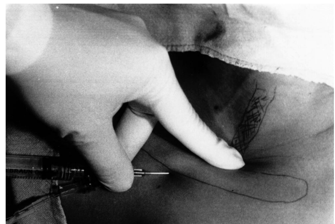
Fig. 1. The introducer needle is held in situ after puncture of the subclavian vein. The ipsilateral internal jugular vein (lying beneath the shaded area) is compressed externally in the supraclavicular area with the index finger of the left hand during the introduction of the "J-tip" guidewire with the right hand.

The characteristics of the patients in both groups were comparable (table-1). Ninety-eight patients in the control group and 97 patients in the study group had successful cannulation of the subclavian vein with the introducer needle. In the control group there were seven (7.14%) misplaced catheters detected with chest x-ray; six (6.12%) patients had misplacement of catheter into the ipsilateral IJV, and one (1.02%) into the contralateral subclavian vein. In the study group there were two (2.06%) misplaced catheters and both were in the contralateral subclavian vein. Difficulty was experienced during guidewire insertion with 4 patients of the control group and with 9 patients of the study group. Two patients in each group had mild pneumothoracies, which appeared on the chest x-ray. None of the study group patients complained of any untoward effects. Three patients in the control group complained of pain in the right ear and one patient experienced trickling sensations in the throat during the placement of the guidewire. No difficulties were encountered during the insertion of the