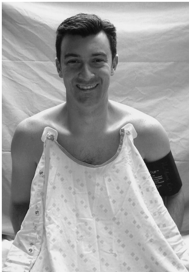
Fig. 1. Frontal view of electrocardiographic contact placement.

Support was provided solely from institutional and/or departmental sources.