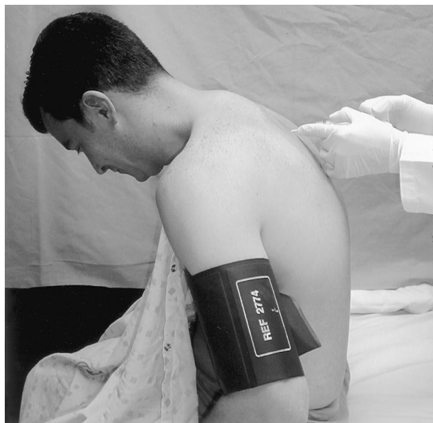
Fig. 2. Lateral view of unencumbered field.

(Accepted for publication June 16, 2000.)