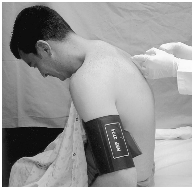
Fig. 2. Lateral view of unencumbered field.

(Accepted for publication June 16, 2000.)