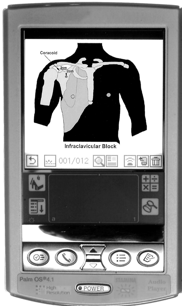
Fig. 1. Sony Clie Personal Data Assistant (PDA).

play, or visual -based applications. Our PDA-based teaching tools are merely a specific application of the current display capabilities of the newest generation of PDAs.