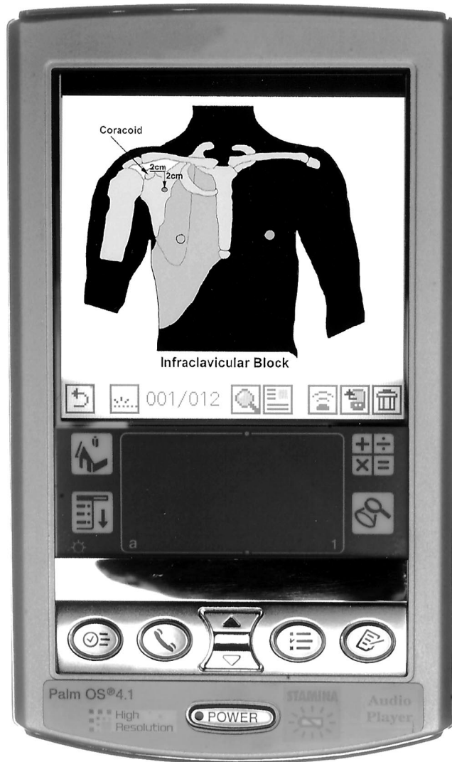
Fig. 1. Sony Clie Personal Data Assistant (PDA).

play, or visual -based applications. Our PDA-based teaching tools are merely a specific application of the current display capabilities of the newest generation of PDAs.