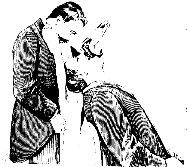
Fig. 2. Line engraving of Kirstein performing laryngoscopy. Reprinted with permission. 2

position adopted for autscopy (laryngoscopy) must therefore be somewhere between the two positions just mentioned . . . . [fig. 1]