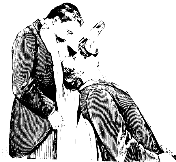
Fig. 2. Line engraving of Kirstein performing laryngoscopy. Reprinted with permission. 2

position adopted for autscopy (laryngoscopy) must therefore be somewhere between the two positions just mentioned . . . . [fig. 1]