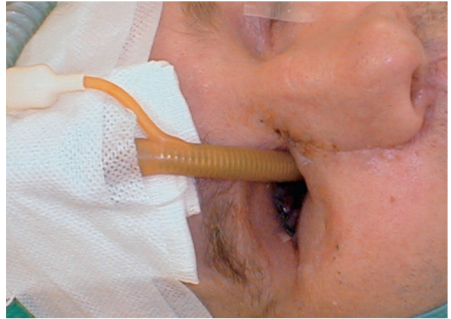
Fig. 1. The endotracheal tube was placed fiberoptically through the right orbit, which was communicating with the larynx.

In conclusion, the technique we describe for the first time offers safe and elegant airway management for patients with a frozen temporomandibular joint and airway alterations, including a communication