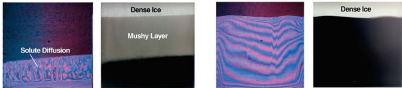
Hypo-eutectic Aqueous Solution, C_i=5\text{wt}\%