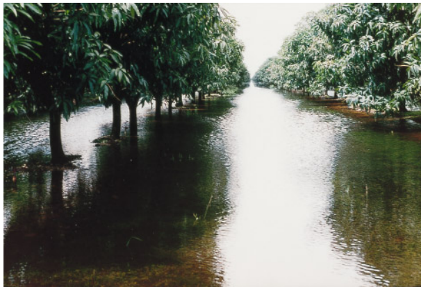
FIG. 1. Flooding of a mango ( Mangifera indica L.) orchard near the Everglades National Park in southern Florida after 3 d of heavy rainfall.

Net CO 2 assimilation declines shortly after avocado trees are flooded (Schaffer et al. , 1992; Whiley and Schaffer, 1994). Furthermore, there is an additive negative effect of