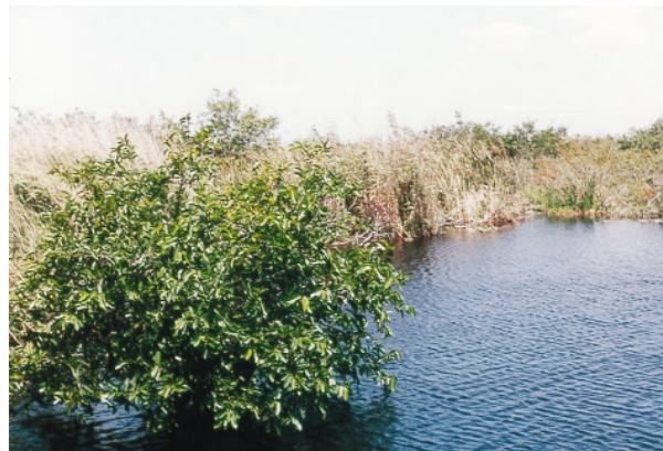
FIG. 3. A pond apple ( Annona glabra L.) tree growing in water in Everglades National Park, Florida.

Starfruit, cultivar 'Golden Star', trees were able to recover from intermittent flooding (repeatedly flooded for 21 d, unflooded for 21 d or flooded for 21 d unflooded for 42 d) as indicated by recovery of net CO_2 assimilation,