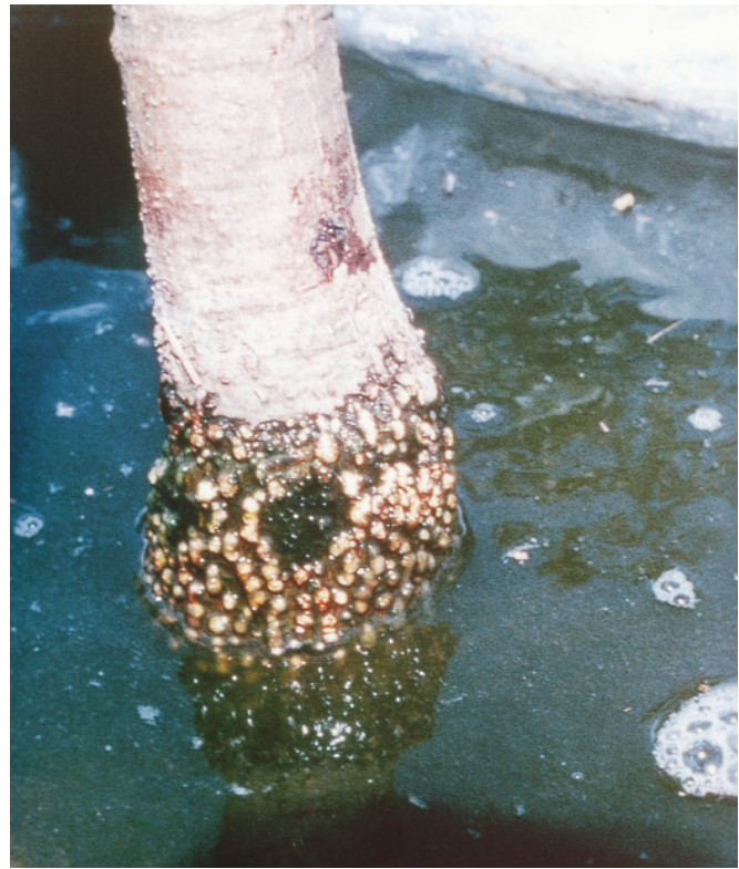
FIG. 2. Hypertrophied lenticels on the stem of a flooded mango ( Mangifera indica L.) tree.

Mango is considered to be a moderately flood-tolerant species (Schaffer et al. , 1994; Whiley and Schaffer, 1997). However, vegetative growth of mango trees generally declines if trees are flooded for more than 2–3 d. When containerized trees growing in limestone soil were flooded for more than 110 d there was a 94% reduction in shoot extension growth, while flooding for approx. 10 d resulted in a 57% reduction in shoot extension growth (Larson et al. , 1991a). In a subsequent study, stem radial growth (a more sensitive indicator of tree growth than shoot extension growth) of mango trees decreased 2 weeks after roots were submerged. Flooding for more than 14 d also significantly reduced root dry weight, resulting in an increased shoot to root ratio (Larson et al. , 1991a). These adverse effects of flooding on the growth of mango trees resulted from